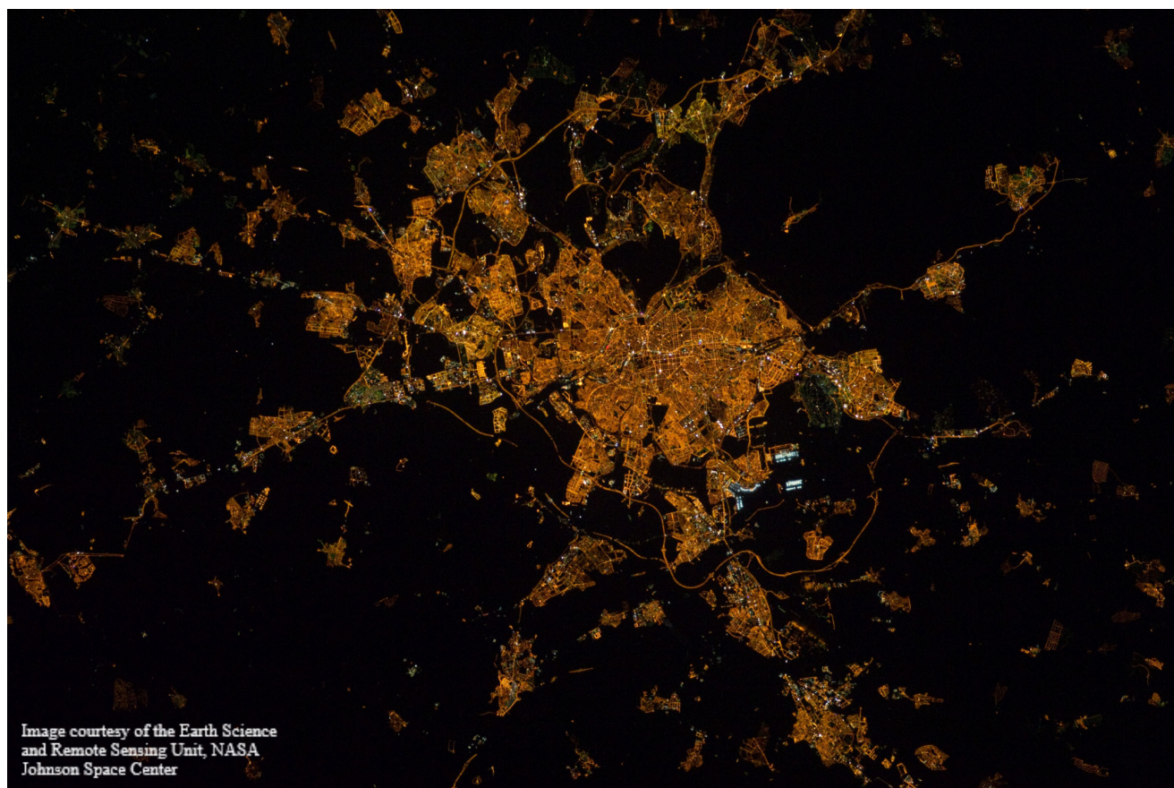
Figure 1. International Space Station night image of Madrid 12 February 2012, time: 02:22:46 GMT (local time 03:22:46) (ISS030-E-82052 ).

We also calculated an index of outdoor blue light spectrum using an approach described in Aubé et al. (2013) to calculate the melatonin suppression index (MSI) at each pixel of the image. The MSI is related to exposure to blue light and is a metric